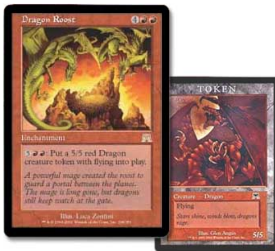
The Dragon Token will be available through the Player Rewards Program shortly.

"What are you doing?" she asked. "Thinking about my second Onslaught preview card," I answered. "What is it called?" "Dragon Roost." "Cool name." "Yeah." "What does it do?" "Makes dragon tokens." "Really? That's cool too." "Yeah." "Is there a downside?" "It's pretty expensive." "Who cares? You're making DRAGONS!"